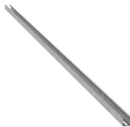
MAFI 913310 2475 mm

Please visit https://www.mafigroup.com/how-to-order/ for regional contact information.