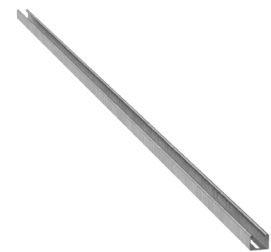
MAFI 913311 3600 mm